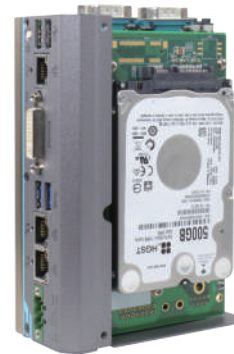
▲ POC-300 with MeziO® - R11 and 2.5" HDD

** For sub-zero operating temperature, a wide temperature HDD drive or Solid State Disk (SSD) is required.